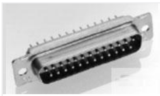
TE Part #205168-1 AMPLIMITE,ASY,PLUG,STD,109,4