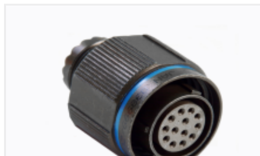
TE Part #YDTS26W25-35PNV001 PLUG ASSY