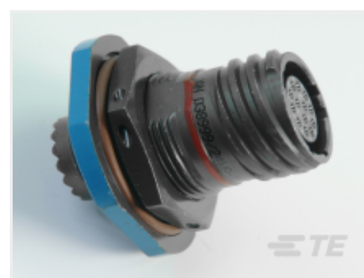
TE Part #YDTS24F13-98SAV001 RECP ASSY