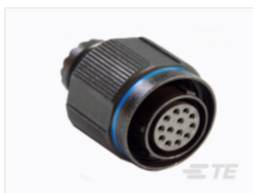
TE Part #CAT-D38999-DTS18N Straight Plug: D38999, 13-35 Insert, Electroless Nickel Plating