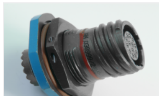
TE Part #YDTS24F09-35PAV001 RECP ASSY