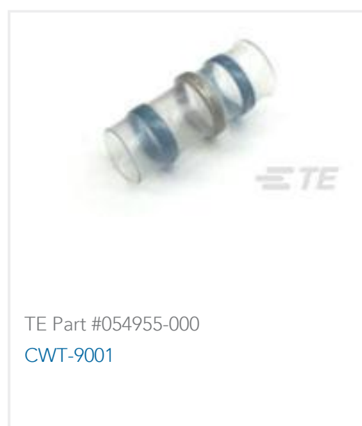
TE Part #054955-000 CWT-9001