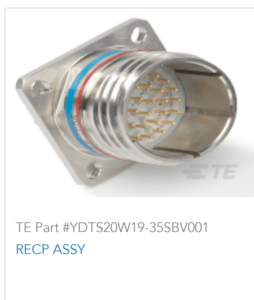
TE Part #YDTS20W19-35SBV001 RECP ASSY