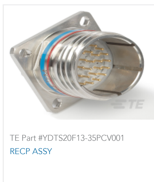
TE Part #YDTS20F13-35PCV001 RECP ASSY