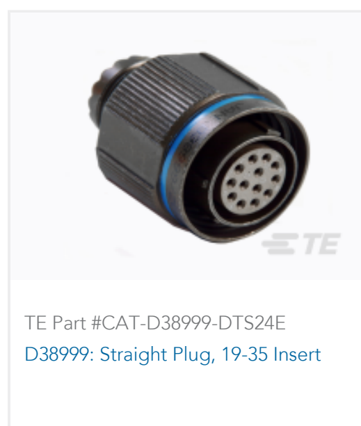
TE Part #CAT-D38999-DTS24E D38999: Straight Plug, 19-35 Insert