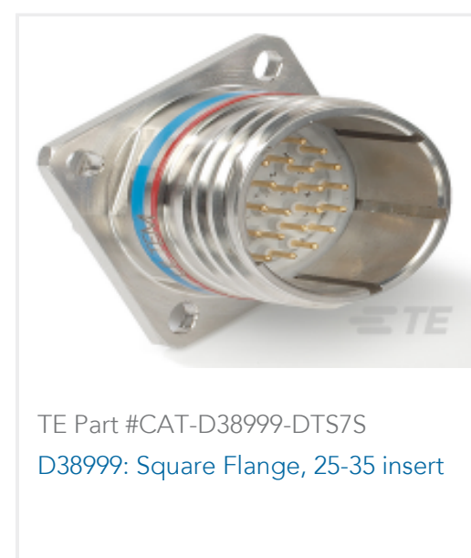
TE Part #CAT-D38999-DTS7S D38999: Square Flange, 25-35 insert