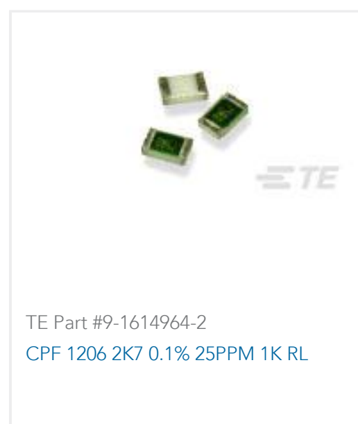
TE Part #9-1614964-2 CPF 1206 2K7 0.1% 25PPM 1K RL