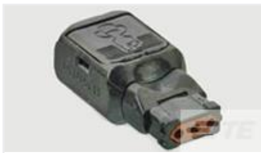
TE Part #D369-R33-NS0 369 3 WAY REC, NO CONTACTS, SKT