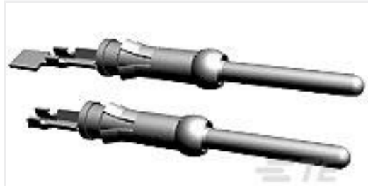
TE Part #66361-3 III+ PIN,18-14,15AU/FL,LP