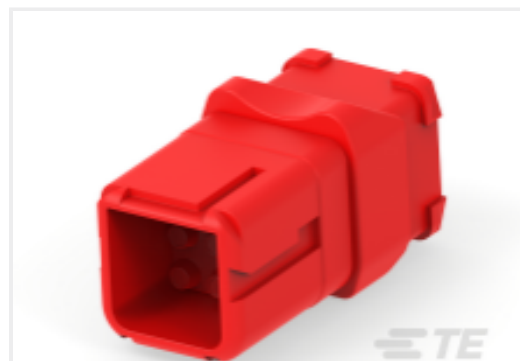
TE Part #CAT-D369-R99 Rectangular Connectors, 9 Way Receptacle