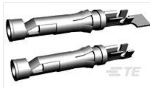
TE Part #66360-3 III+ SKT,18-14,15AU/FL,LP