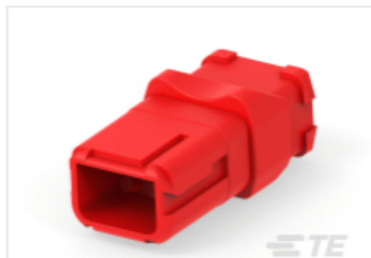
TE Part #CAT-D369-R66 Rectangular Connectors, 6 Way Receptacle