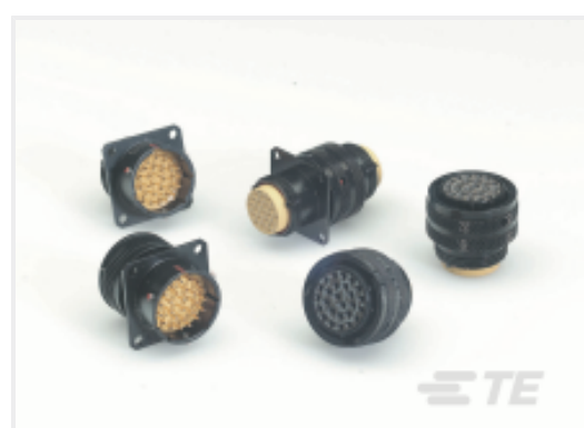
TE Part #ZPF000000000019245 FDDB 56-14-12 SN-K-B246