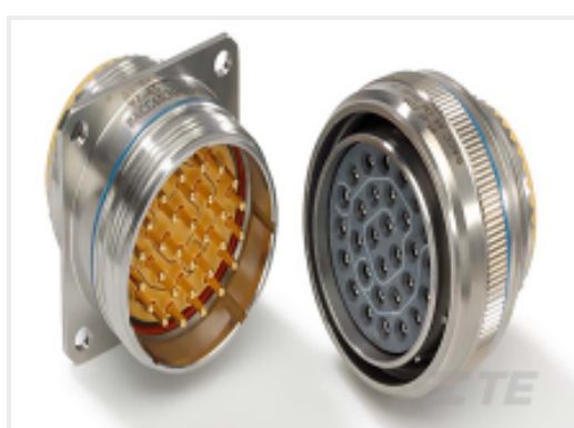
TE Part #ZPF000000000008319 983-6R 10-06 SN-L