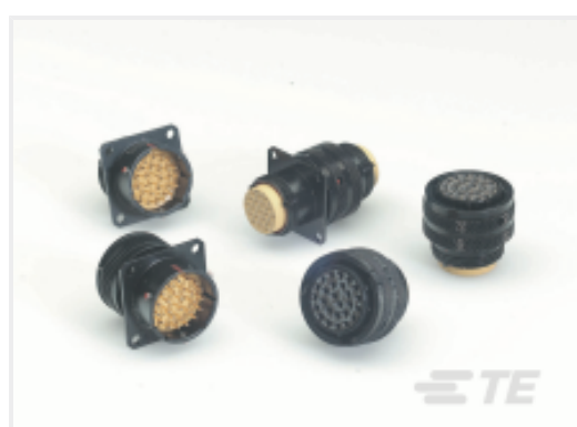
TE Part #ZPF000000000019853 FDDB 57-10-6 SW-K-A5610