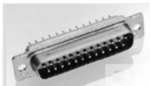
TE Part #207253-2 RECEPT ASSY, 9 POSN, AMPLIMITE