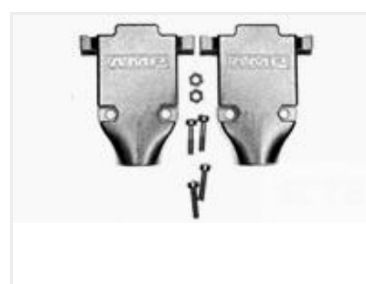
TE Part #5748676-4 DIE CAST CBL CLMP KIT,SZ 4