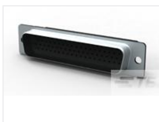
TE Part #1658674-1 HDP-22,PLUG,SIZE 5,78 POSN