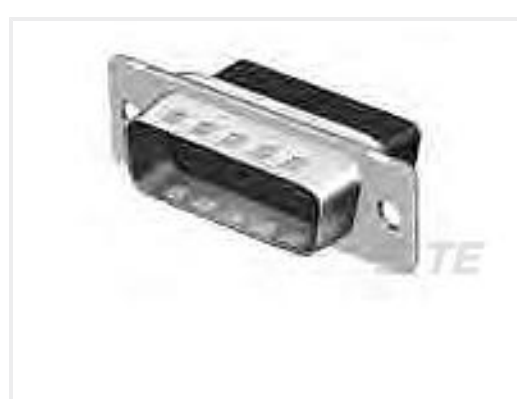
TE Part #5205208-1 CRIMP SNAP PLUG ASSY, 25 POS