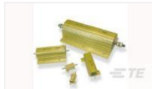
TE Part #3-1630012-5 HSC150 510R 5%