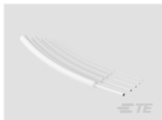
TE Part #CAT-HST-RNF100-WH RNF-100-WH Heat Shrink Tubing