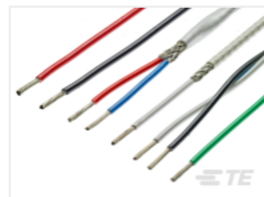
TE Part #EM4492-000 55A8081-18-9-L391