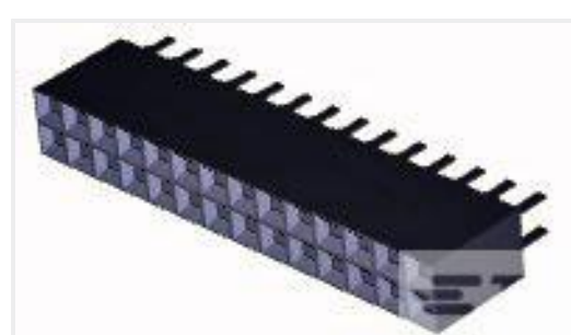
TE Part #6-534206-4 28 MODII VRT DR CE 100/115