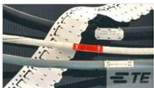
TE Part #0479490001 HTCM-SCE-1/2-4H-9