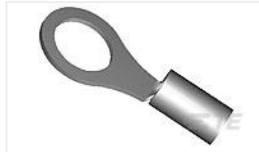
TE Part #2-326819-1 PG R 22-16 COMM 22-18 MIL 6