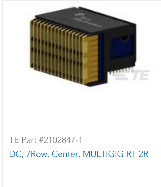
TE Part #2102847-1 DC, 7Row, Center, MULTIGIG RT 2R