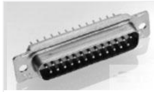
TE Part #1218125-2 15 POS,ASSY,PLUG,LOW PROF,109