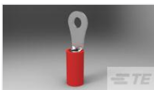
TE Part #31880 PIDG R 22-16 COMM 22-18 MIL 4