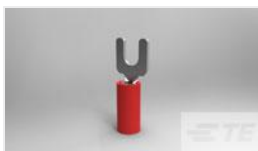
TE Part #34541 PIDG SPD 22-16 COMM 22-18MIL 6