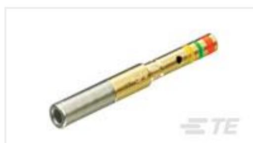
TE Part #38946-22 CONTACTS (=724-0003-22)