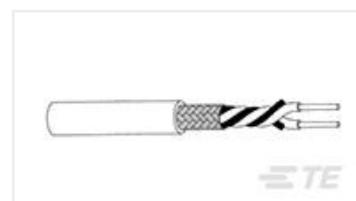
TE Part #469411-000 0024A0024-9X