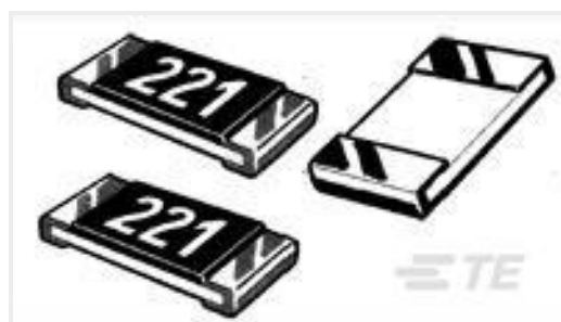
TE Part #1-2176070-4 3521 36R 1% 2W