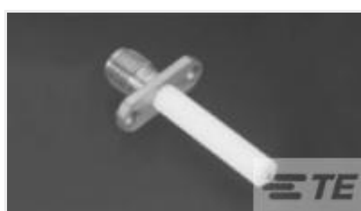
TE Part #1052552-1 2052 1352 02,SMA FM JACK RECPT