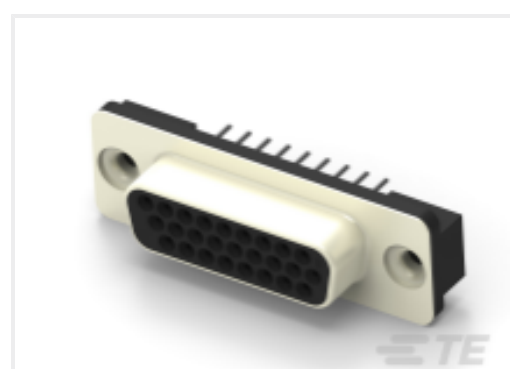
TE Part #2317170-1 AMPL REC HD22, VERT, 26P, THREADED