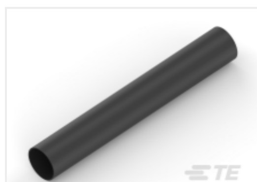
TE Part #NB11802001 ATUM-8/2-0-STK