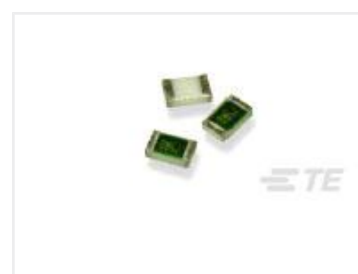
TE Part #1879417-1 CPF0603 510K 0.1% 25PPM 5K RL