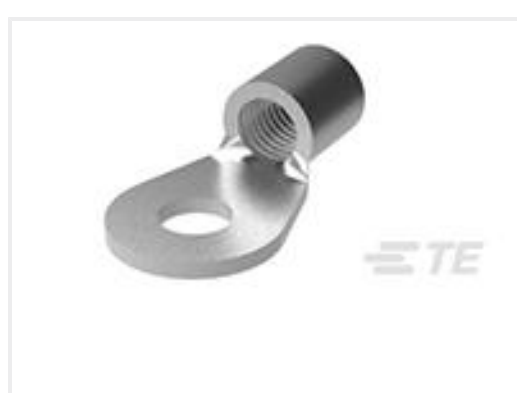
TE Part #2-322796-1 STRATO R 22-16COMM 22-18MIL 4