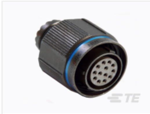
TE Part #YDTS26G11-99PNV001 PLUG ASSY