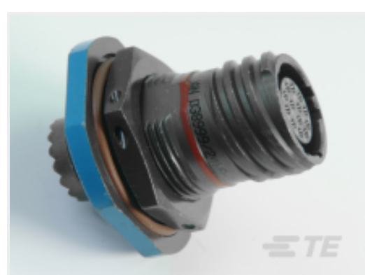
TE Part #YDTS24F11-99PNV001 RECP ASSY