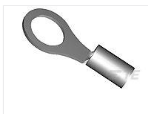
TE Part #322797 SOLIS R HR 22-16COM 22-18MIL 6