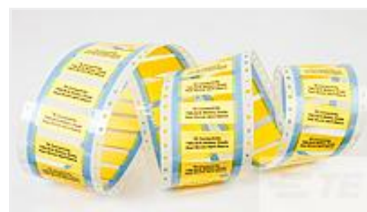
TE Part #5061850001 TMS-SCE-1/2-2.0-9