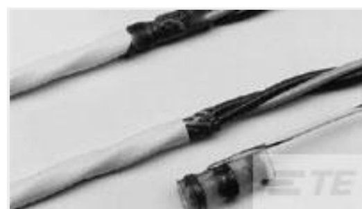
TE Part #F45323-000 B-155-23