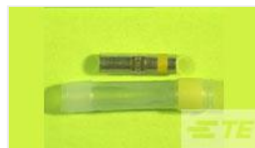
TE Part #650129-000 D-436-85