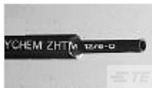
TE Part #2109474003 ZHTM-18/9-0-SP