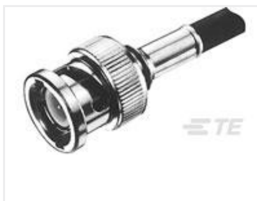
TE Part #5225395-7 BNC PLUG DUAL CRIMP RG174,188