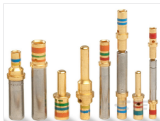
TE Part #38943-20L CONT SOC ASSY