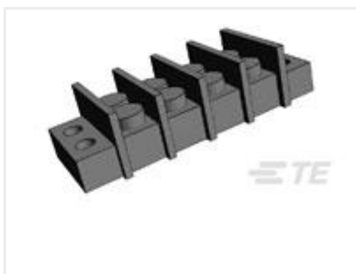
TE Part #1546306-4 4P .374" DR BARRIER STRIP