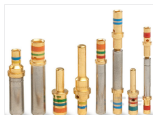
TE Part #0641-1-2031L CONT PIN