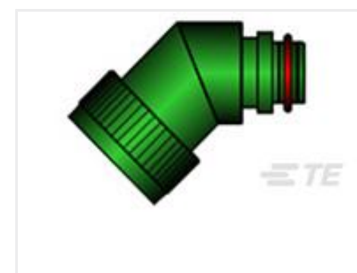
TE Part #701221-000 TXR40AB45-1006AI