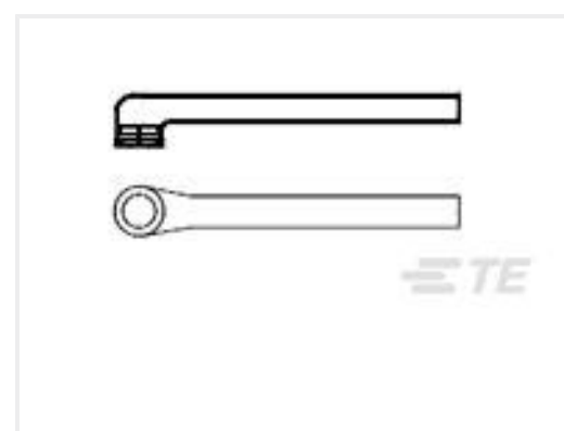
TE Part #440481-000 222D132-4/86-0