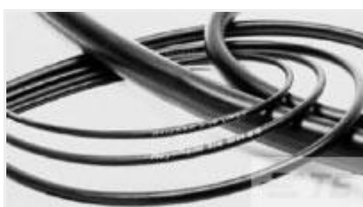
TE Part #5039264026 DR-25-3/8-0-SP