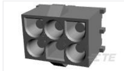
TE Part #350762-5 06P UMNL HDR ASSY PC LF