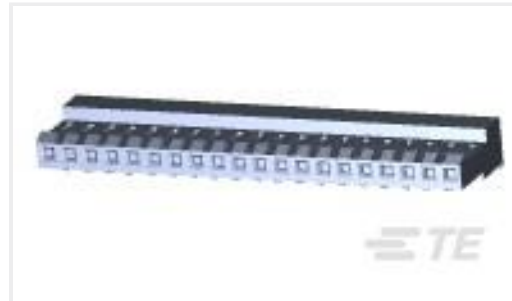
TE Part #5-640426-0 20P MTA156 CONN ASSY 18AWG ORA