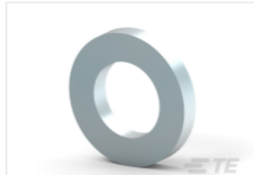
TE Part #5205820-3 WASHER,FLAT #4,PLATED