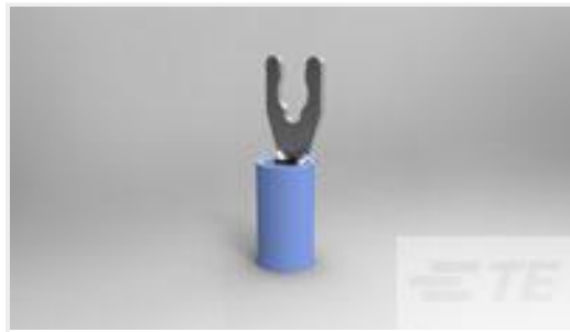
TE Part #52935 TERMINAL,PIDG SPR SPD 16-14 6