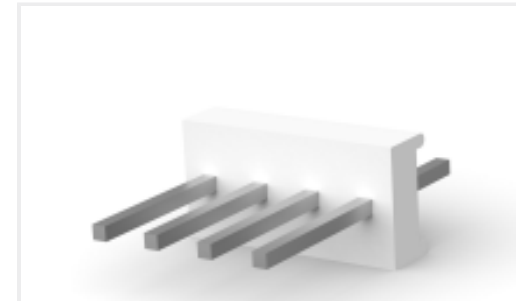
TE Part #CAT-104MTA-PVUNH PCB Header: Polyester, Vertical, Unshrouded, No Mating Alignment