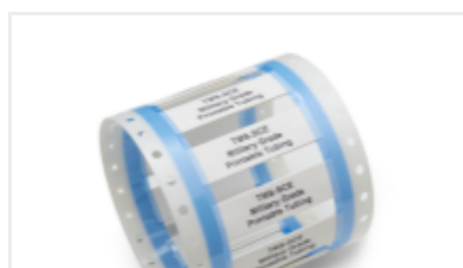
TE Part #CAT-T3437-T548 TMS-SCE Military Grade Sleeves