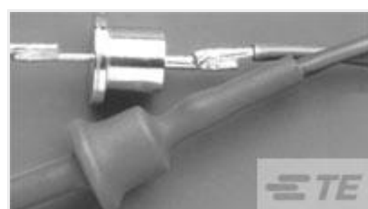
TE Part #5677964005 RNF-3000-39/13-X-SP