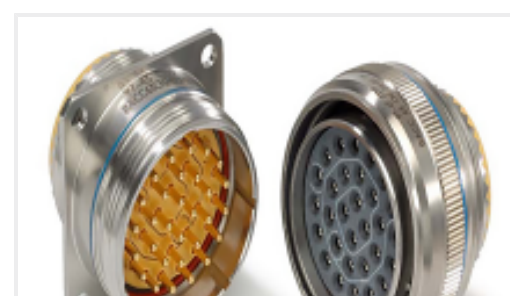
TE Part #ZPF000000000103721 983-6A 10-05 SN