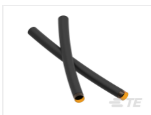
TE Part #NB13892001 TAT-125-1/2-0-STK