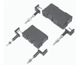
CAMaster accessories - Studs