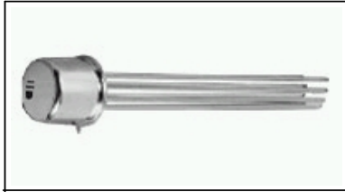
JMSCD - 5XM (1 - 1617128 - 7)