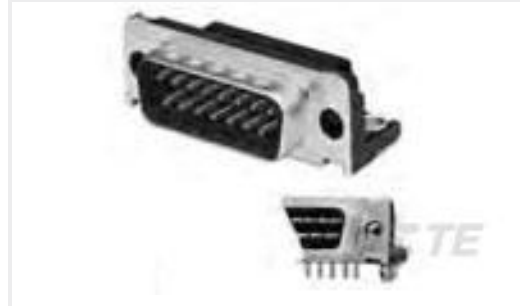
TE Part #5747843-4 37 MSFL PLUG RA 318 (IN,FM,BL)