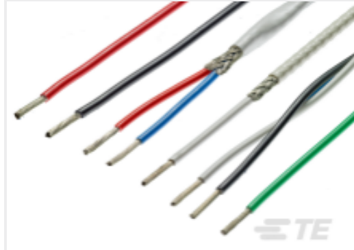
TE Part #941657-000 CXA-0078-24-2-9CS2405