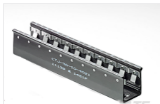
TE Part #CTJ-3D-02 RAIL ASSY