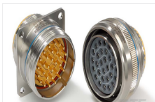
TE Part #ZPF000000000008426 983-6RS 14-04 SN