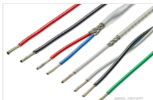
TE Part #CAT-NEMA-M27500-ML NEMA WC27500: Crosslinked Polyalkene Lightweight Cables