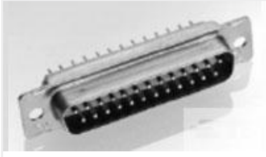
TE Part #205557-2 RECEPT ASSY,15 POSN,AMPLIMITE