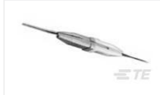
TE Part #91067-1 INSERTION/EXTRACTION TOOL