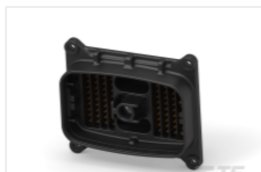
TE Part #DRCP25-86PBB-GC03 HDR, 86P, BLK, ST, 12/20, AU/NI/CU, BB