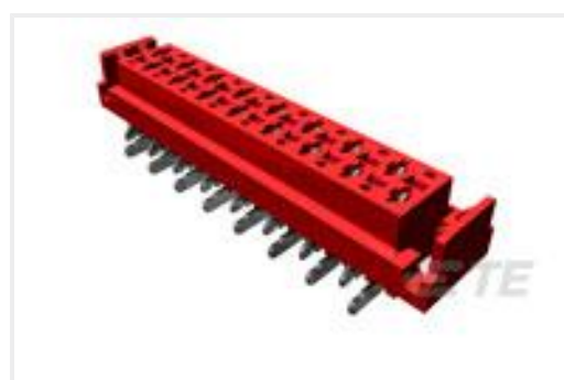
TE Part #2-338069-0 MICRO-MATCH SMD FTE