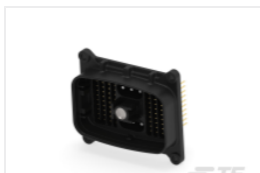
TE Part #DRCP25-86PAA-G003 HDR, 86P, BLK, ST, 12/20, AU/NI/CU, AA