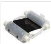
B30 Series R6000 Printer Ribbon, Black