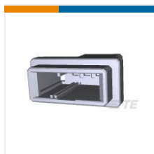
DYNAMIC 3100S TAB HSG 3P Y F/H 2-177648-3