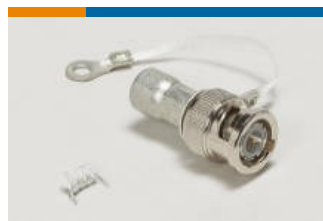
Coax Terminators (4)