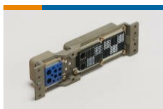
ARINC Optical Termini (2)