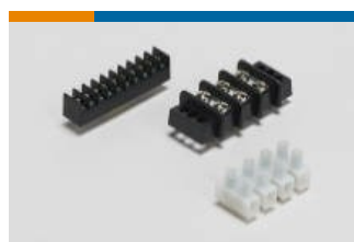
Barrier Strips (14)