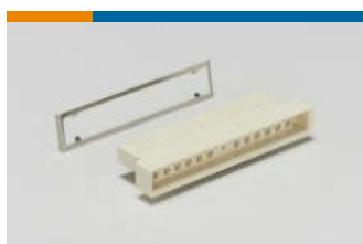
Backplane Fiber Optics (2)