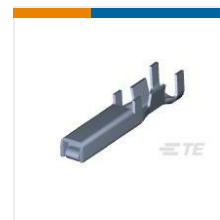
3.81 DYNAMIC REC L LI TN 20-16 1-175218-5