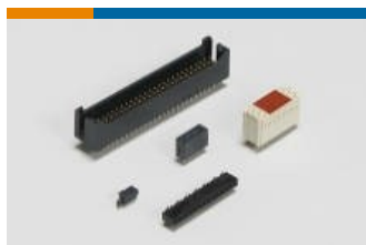
Board-to-Board Headers & Receptacles (91)