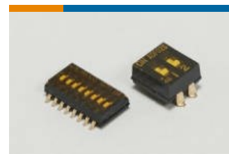
DIP & SIP Switches (1)