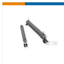
TE 400W 100R 5% Bracket TE400B100RJ