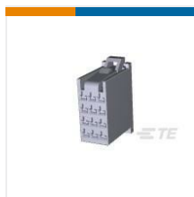
DYNAMIC 3400 REC HSG 12P 178214-1