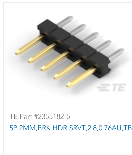
TE Part #2355182-5 5P,2MM,BRK HDR,SRVT,2,8,0.76AU,TB