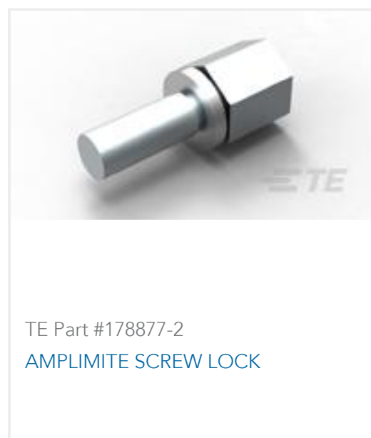
TE Part #178877-2 AMPLIMITE SCREW LOCK