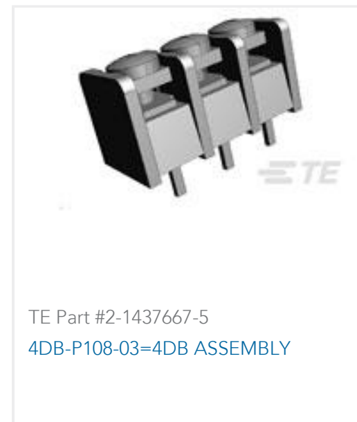
TE Part #2-1437667-5 4DB-P108-03=4DB ASSEMBLY