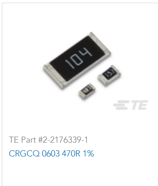
TE Part #2-2176339-1 CRGCQ 0603 470R 1%