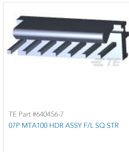
TE Part #640456-7 07P MTA100 HDR ASSY F/L SQ STR