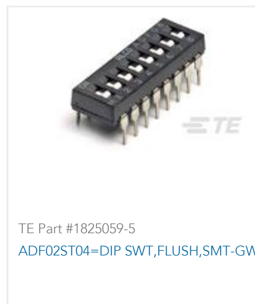
TE Part #1825059-5 ADF02ST04=DIP SWT,FLUSH,SMT-GW