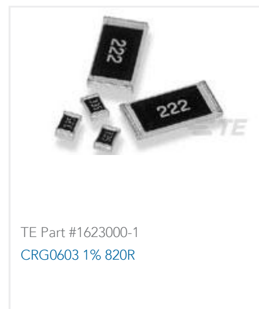
TE Part #1623000-1 CRG0603 1% 820R