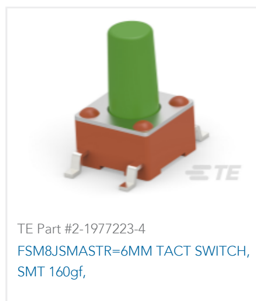
TE Part #2-1977223-4 FSM8JSMATR=6MM TACT SWITCH, SMT 160gf,