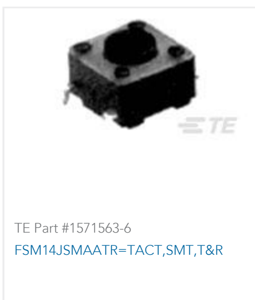
TE Part #1571563-6 FSM14JSMATR=TACT,SMT,T&R