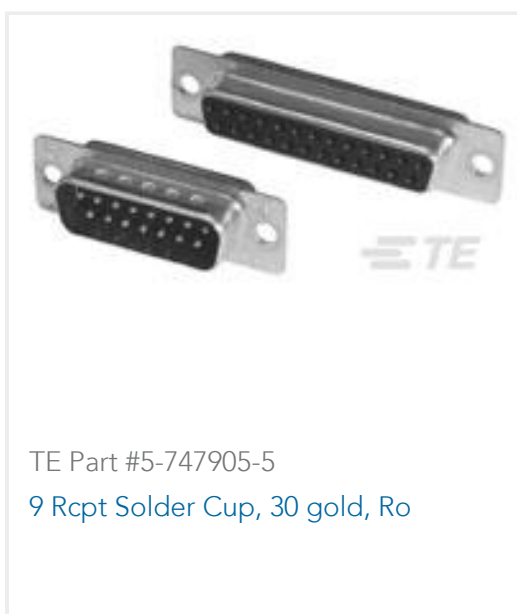
TE Part #5-747905-5 9 Rcpt Solder Cup, 30 gold, Ro