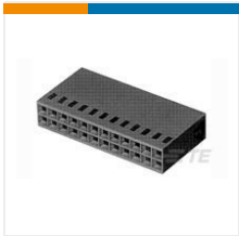
30 MODIV HSG DR MRKD .100CL