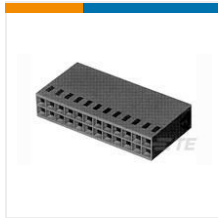
40 MODIV HSG DR MRKD .100CL 3-87456-6