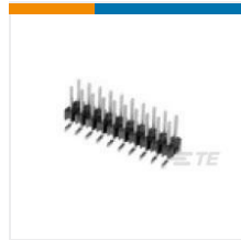
10 MODII HDR DRST SFMNT B/A LF 5-146130-4