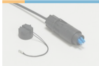
Rugged Fiber Cable Assemblies (34)