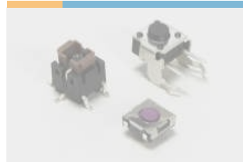
Tactile Switches (3)