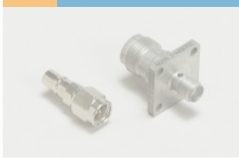
Between Series Adapters (2)