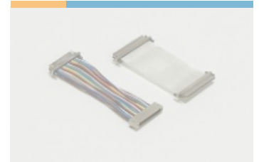
Wire-to-Board Jumpers & Shunts (11)