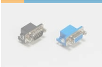
PCB D-Sub Connectors (60)