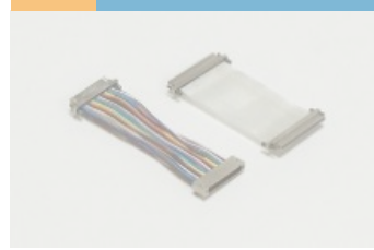
Wire-to-Board Jumpers & Shunts (2)