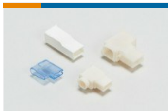
Crimp Terminal Housings (102)