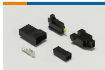
Magnet Wire Terminals (1)