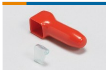
Insulation Boots & Sleeves (16)