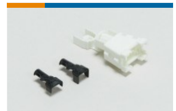
Rectangular Backshells & Clamps (3)