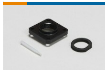
Circular Connector Seals (1)