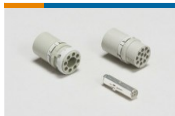
Circular Connector Contact Inserts (2)