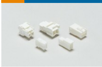
Rectangular Power Connectors (41)