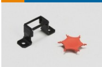
Terminal Block Hardware (26)