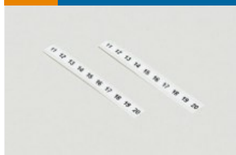
Terminal Block Marking (4)