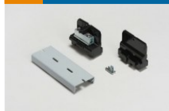
Terminal Blocks (158)