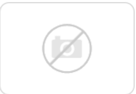
PLATE ADAPTOR 690671-1 TE Internal Number: 690671-1

! Detailed product features are not currently available online.