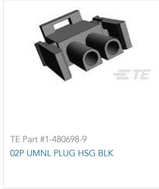
TE Part #1-480698-9 02P UMNL PLUG HSG BLK