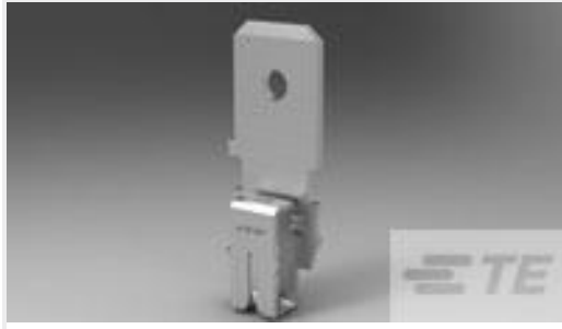
TE Part #63614-1 MAG-MATE 250 TAB 19-17 TPBR