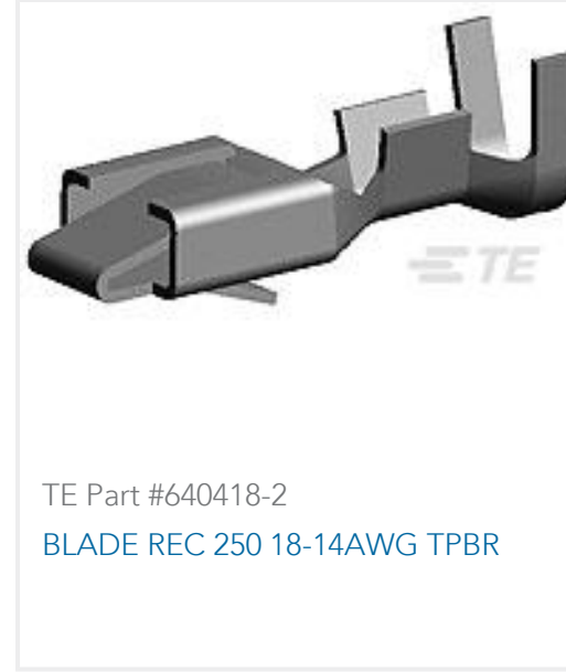
TE Part #640418-2 BLADE REC 250 18-14AWG TPBR