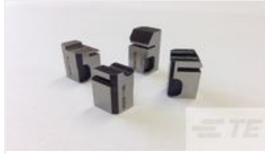
TE Part #1-462006-1 SHEAR, FRONT FLOATING