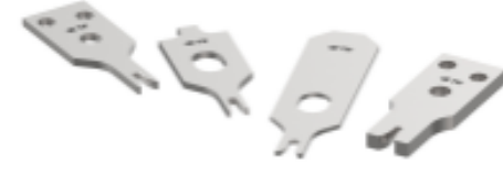
CRIMPER REPRESENTATION ONLY