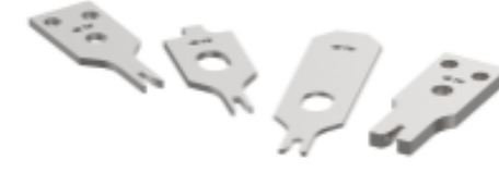
CRIMPER REPRESENTATION ONLY