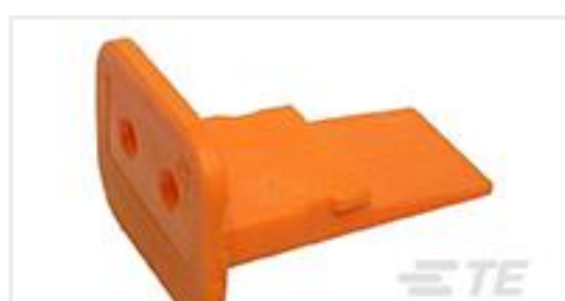
TE Part #W2S WEDGE LOCK, 2P, PLG, ORG, STD, DT