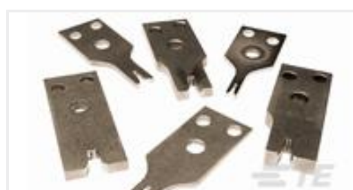
TE Part #456402-1 CRIMPER WIRE .055 F