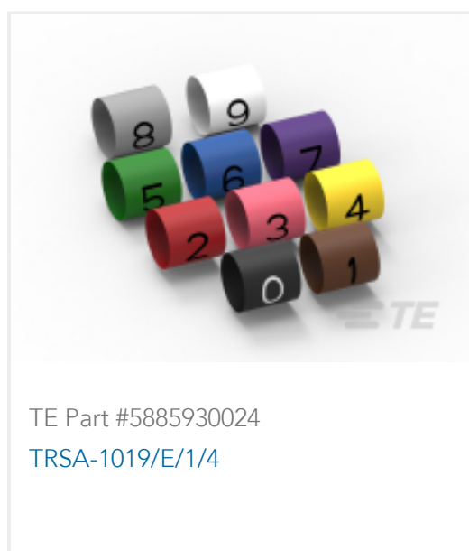
TE Part #5885930024 TRSA-1019/E/1/4