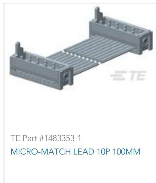
TE Part #1483353-1 MICRO-MATCH LEAD 10P 100MM