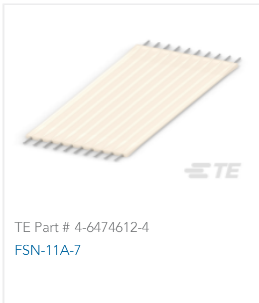
TE Part # 4-6474612-4 FSN-11A-7