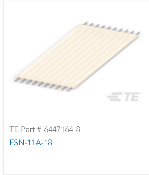
TE Part # 6447164-8 FSN-11A-18