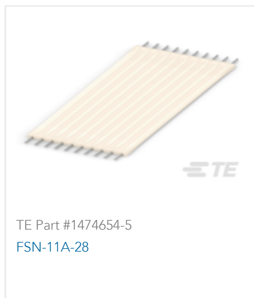
TE Part #1474654-5 FSN-11A-28