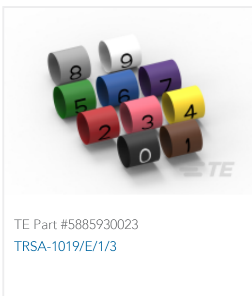
TE Part #5885930023 TRSA-1019/E/1/3