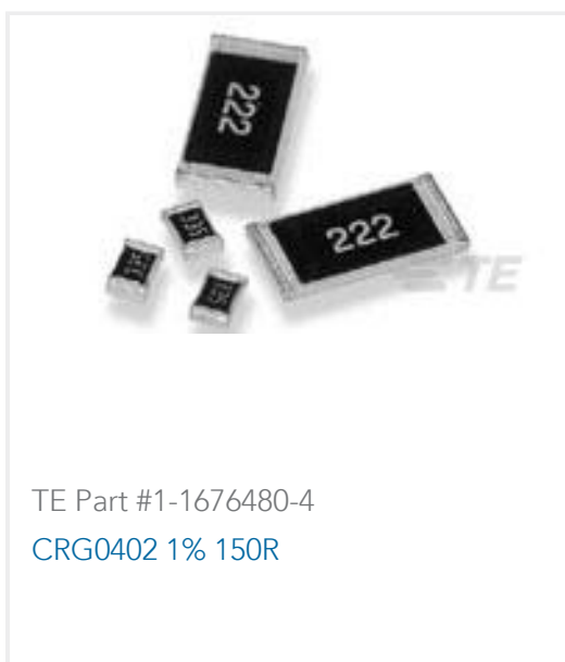
TE Part #1-1676480-4 CRG0402 1% 150R