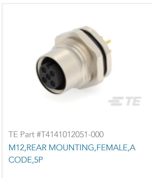
TE Part #T4141012051-000 M12,REAR MOUNTING,FEMALE,A CODE,5P