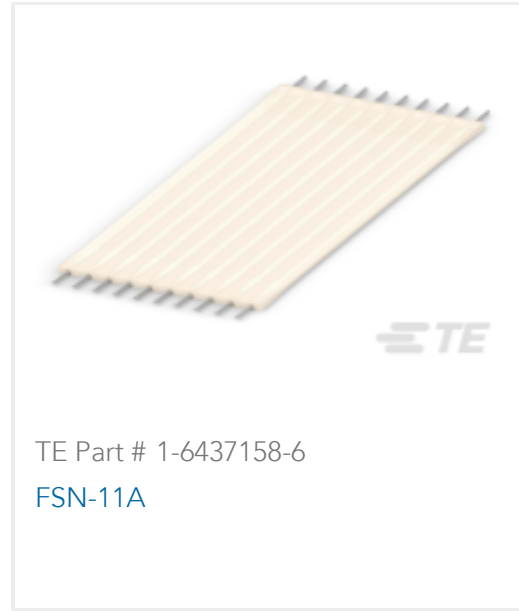
TE Part # 1-6437158-6 FSN-11A