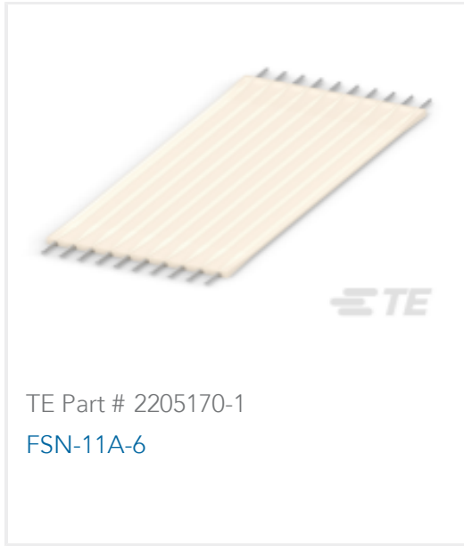
TE Part # 2205170-1 FSN-11A-6