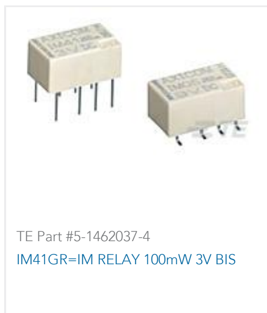
TE Part #5-1462037-4 IM41GR=IM RELAY 100mW 3V BIS