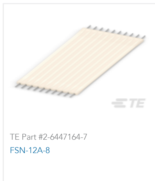
TE Part #2-6447164-7 FSN-12A-8