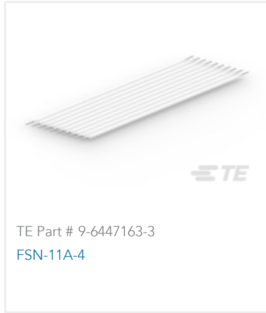
TE Part # 9-6447163-3 FSN-11A-4