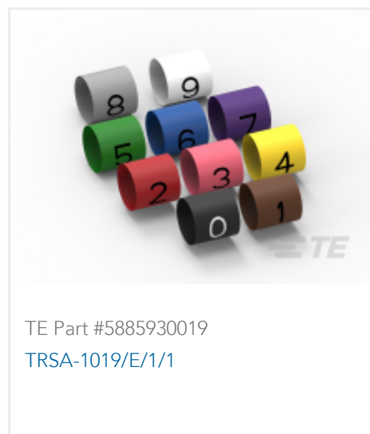
TE Part #5885930019 TRSA-1019/E/1/1