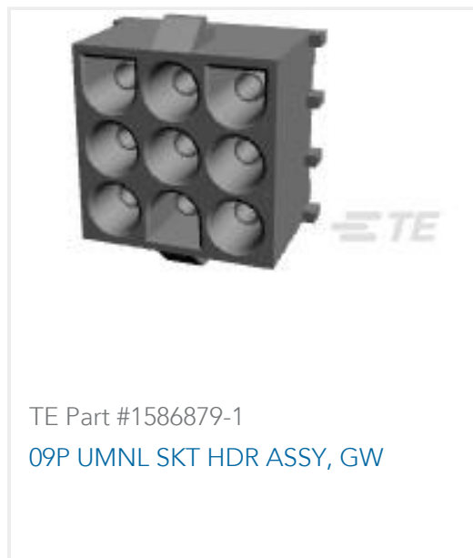
TE Part #1586879-1 09P UMNL SKT HDR ASSY, GW