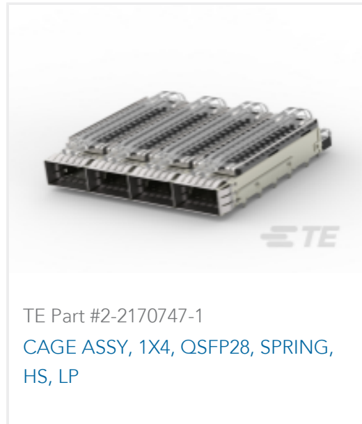
TE Part #2-2170747-1 CAGE ASSY, 1X4, QSFP28, SPRING, HS, LP