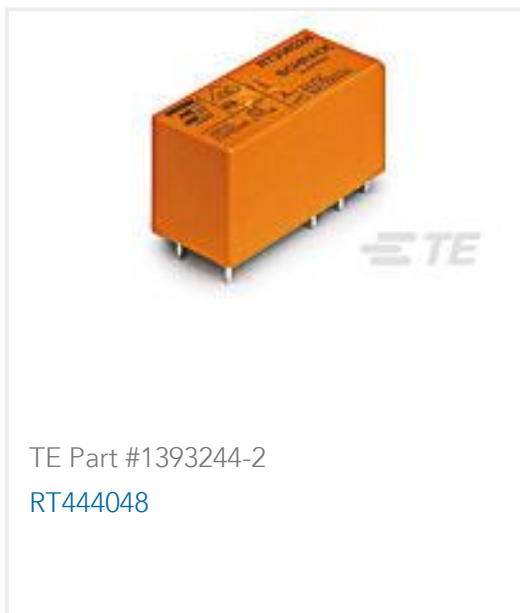
TE Part #1393244-2 RT444048