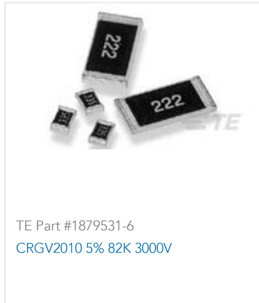
TE Part #1879531-6 CRGV2010 5% 82K 3000V