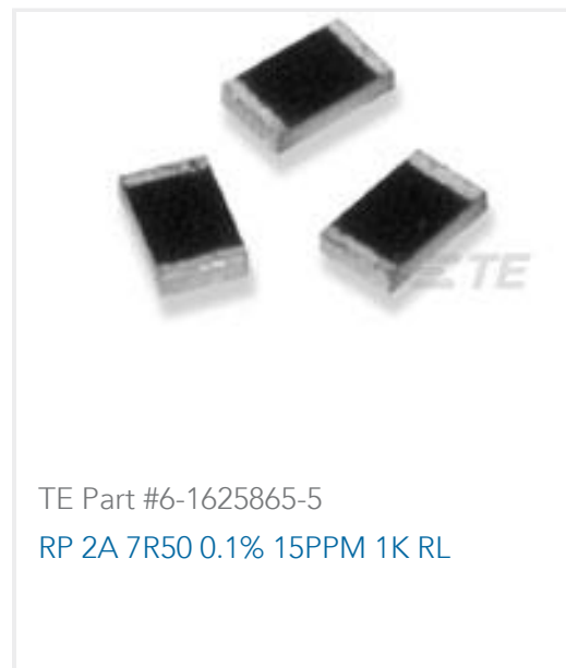
TE Part #6-1625865-5 RP 2A 7R50 0.1% 15PPM 1K RL