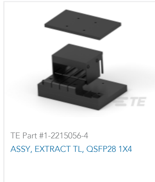
TE Part #1-2215056-4 ASSY, EXTRACT TL, QSFP28 1X4