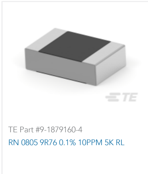
TE Part #9-1879160-4 RN 0805 9R76 0.1% 10PPM 5K RL