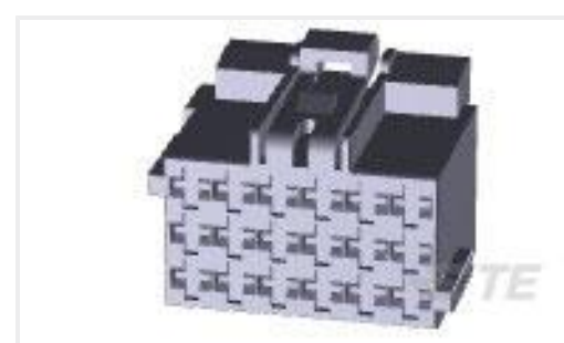
TE Part #1-967624-1 JUN-POW-TIM HOUSING 18POS