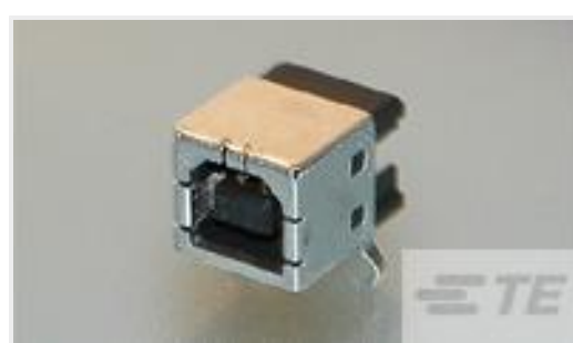
TE Part #292304-1 STD USB TYPE B, R/A, T/H