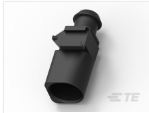
TE Part #2-1418510-1 1,6TAB HSG ASSY2X2P RADIAL SEAL