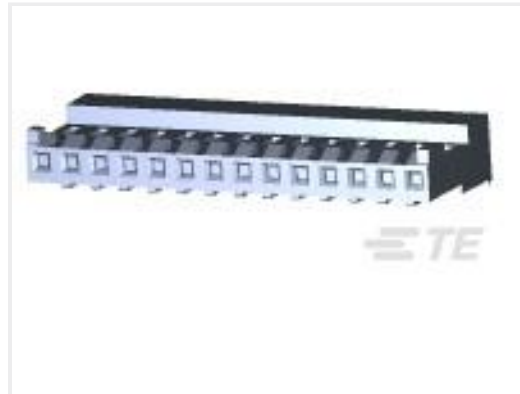
TE Part #4-643818-4 14P MTA156 CONN ASSY 20AWG YEL