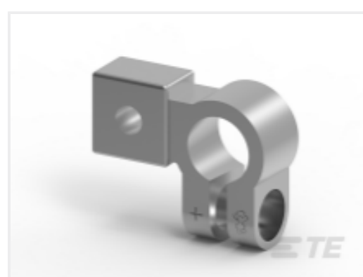
TE Part #YHC59020000000000 BATTERY POST CLAMP.+VE.