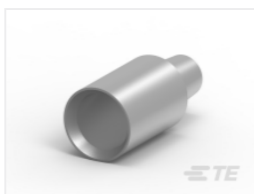
TE Part #HC5843 LEAD CONN. FOR HC5840 & HC58