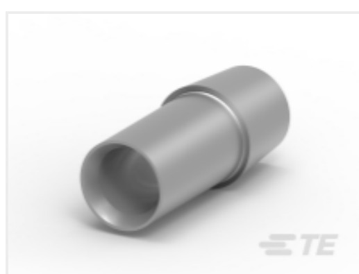
TE Part #YHC59320000000000 BATTERY LEAD CONNECTOR.35MM. +VE.M6 THRD.