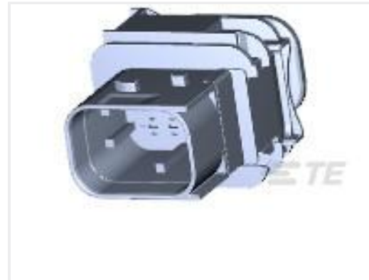
TE Part #2-1703648-1 7POS, MIXED,TAB HSG,ASSY,CODB