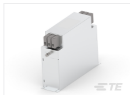
TE Part #818064-SF FN3288HV-50-53-C36-R65