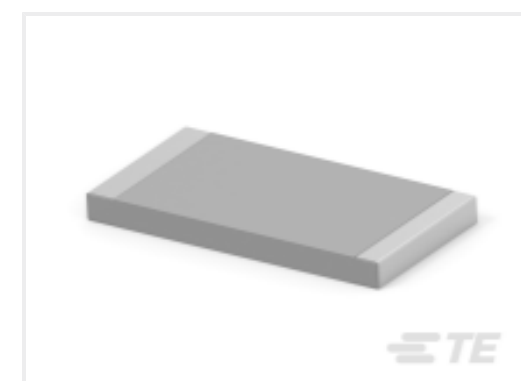
TE Part #3-2176331-3 CRGP 2512 4K7 1%