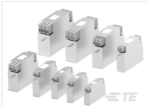
TE Part # CAT-P99-F3288 3-Phase Filters, FN3288 Compact High-Performance EMC/RFI Filter for Inverters and Drive Systems