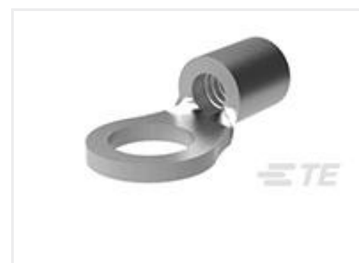
TE Part #34107 SOLIS R 22-16 COMM 22-18 MIL 6