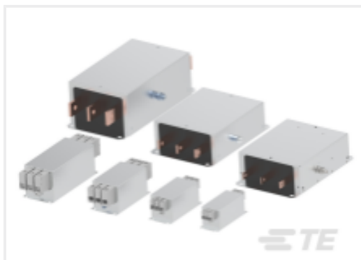
TE Part #CAT-P99-F3270 3-Phase Filters FN3270, Compact EMC /RFI Filter for Industrial Motor Drives