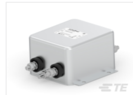
TE Part #800769-SF FN2020-60-24