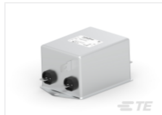
TE Part #802435-SF FN2030-20-06