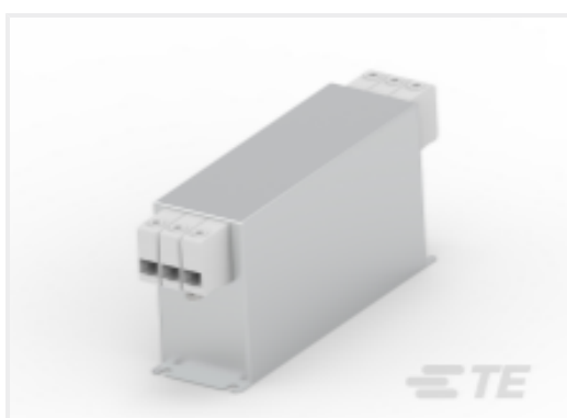
TE Part #802111-SF FN3258-75-34