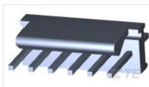
TE Part #640456-6 06P MTA100 HDR ASSY F/L SQ STR