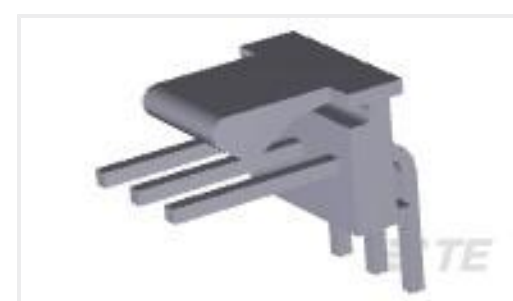
TE Part #640457-3 03P MTA100 HDR ASSY SQ R/A F/L