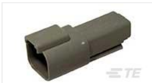
TE Part # DT04-2P REC, 2P, GRY, N