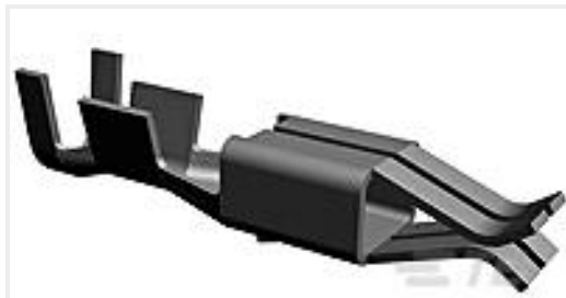
TE Part # 925596-1 MINI SPRING REC. LOOSE PIECE