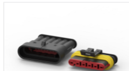
TE Part # CAT-AM71-CH8172 AMP SUPERSEAL 1.5MM, CONNECTOR HOUSING