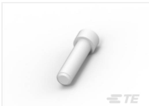
TE Part # 114017-ZZ SEALING PLUG, SIZE 12/16, WHT