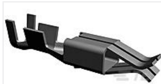
TE Part # 925596-2 JUNIOR TIMER RECEPTACLE