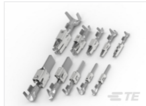
TE Part # CAT-T4827-T273 TIMER, RECEPTACLE AND TAB