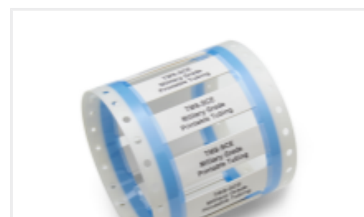
TE Part #CAT-T3437-T548 TMS-SCE Military Grade Sleeves