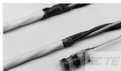
TE Part #764684-000 SO63-2-55-24-90