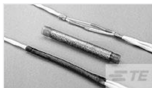
TE Part #A75990-000 D-150-0231-NR