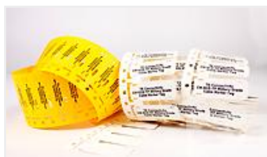
TE Part #E17344-000 CM-SCE-TP-1/2-4H-9