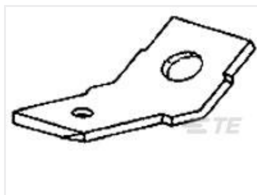
TE Part #61664-1 187 FASTON TAB TPBR