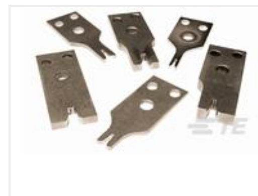
TE Part #456428-1 CRIMPER-WIRE .180 F