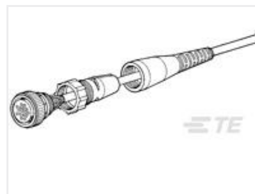
TE Part #207387-2 CABLE GRIP,SZ 17,CPC