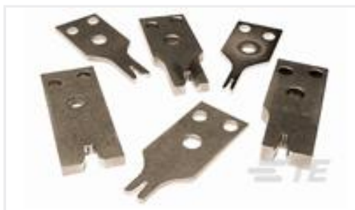
TE Part #456411-1 CRIMPER, WIRE .140 F