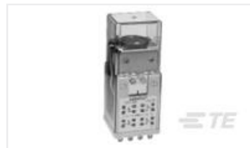
TE Part #1423155-5 GPD=RELAY, 125VDC