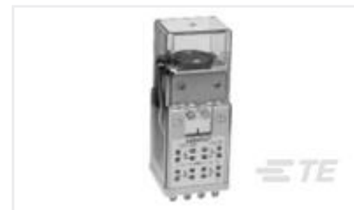
TE Part #1-1423155-4 GPF=RELAY, 250VDC