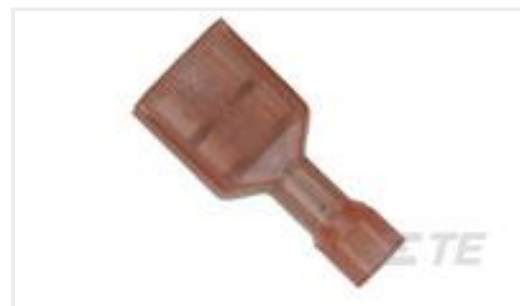
TE Part #2-520183-2 ULTRA-FAST 250 ASY REC 22-18 TPBR