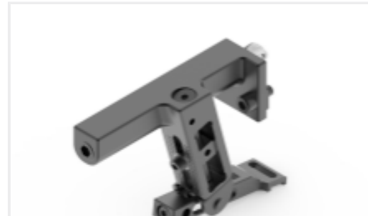
TE Part #2119580-1 MECHANICAL FEED ASSEMBLY