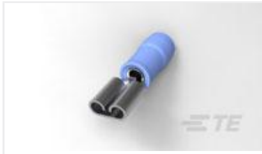
TE Part #640915-2 RECEPT,PIDG FASTON 16-14 205