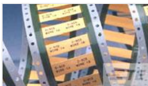
TE Part #1056030001 D-SCE-1K-3.2-50-S1-4