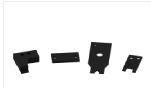
TE Part #240644-9 PLATE-REAR SHEAR