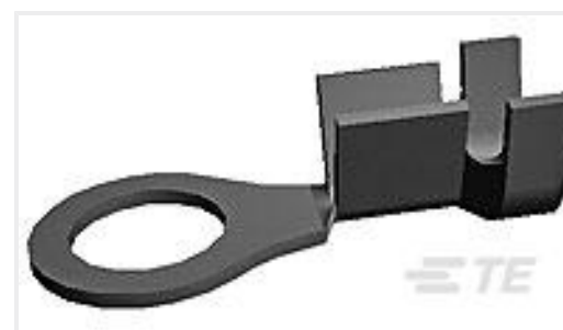
TE Part #61624-1 RING CRIMP 16-12 AWG BR